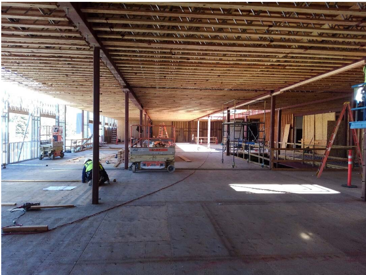
The Second Floor is completely covered over, and we are beginning to lay out walls.