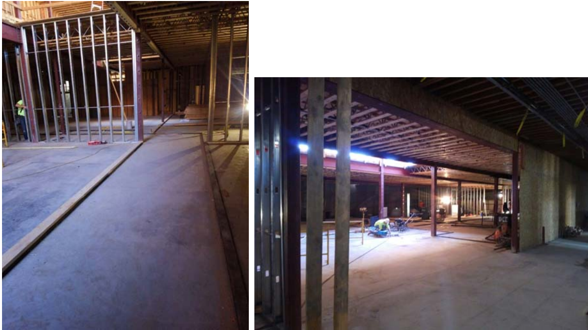
Walls, hallway layout, and the entrance to the grand staircase...the first floor is really coming together.