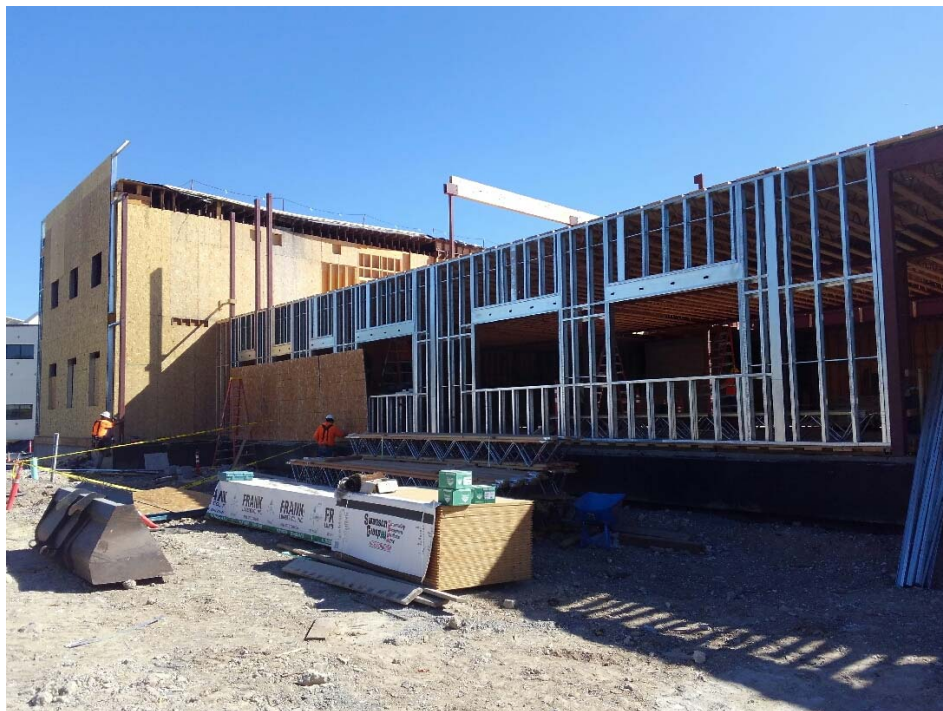
The emerging Monclair St. façade and entrance.