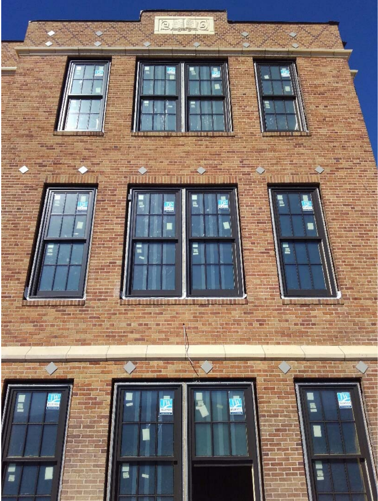
Windows!! New and improved, selected to look historically correct, yet they are double paned and can be opened.