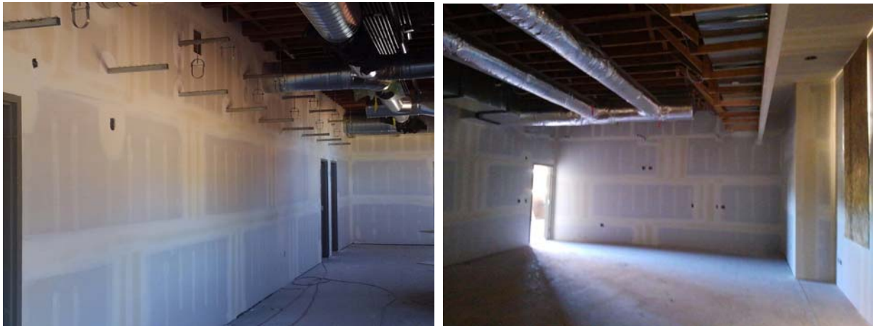
Third Floor hallway and classrooms are being taped and mudded, almost ready for paint.