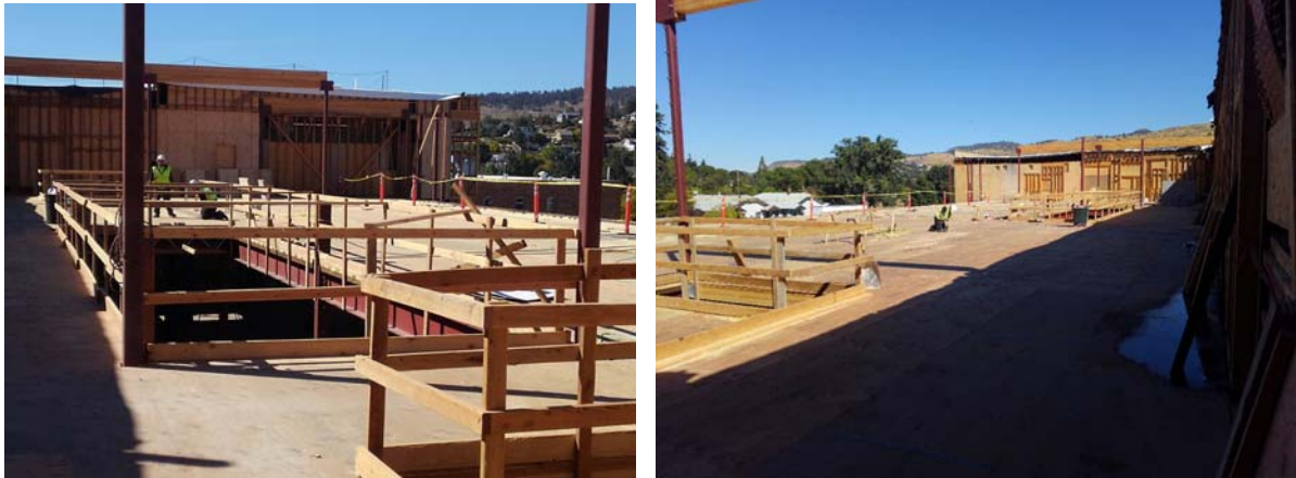
The Third Floor...almost ready for walls to go up! On the left is the grand staircase opening.