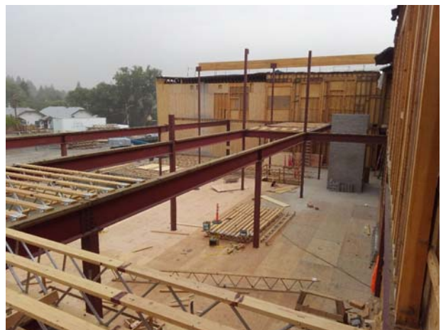
Second floor joists and the sub-floor sheathing are nearly complete... Third Floor well under way!