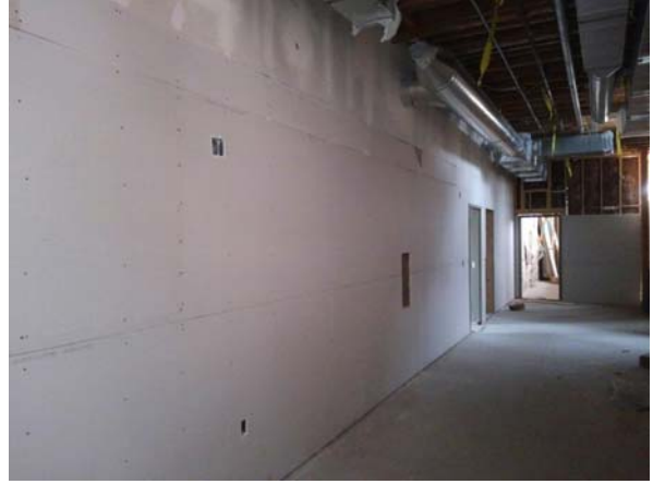
Sheet Rock is going up all over the building...areas are starting to look like hallways and rooms.