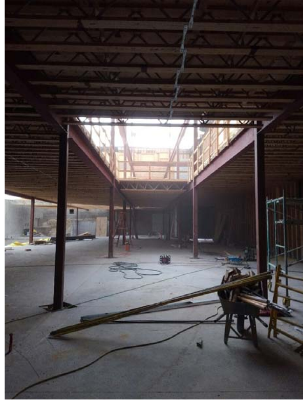
Looking up at the floor joists from the first floor...on the right is the opening for the grand stair case.