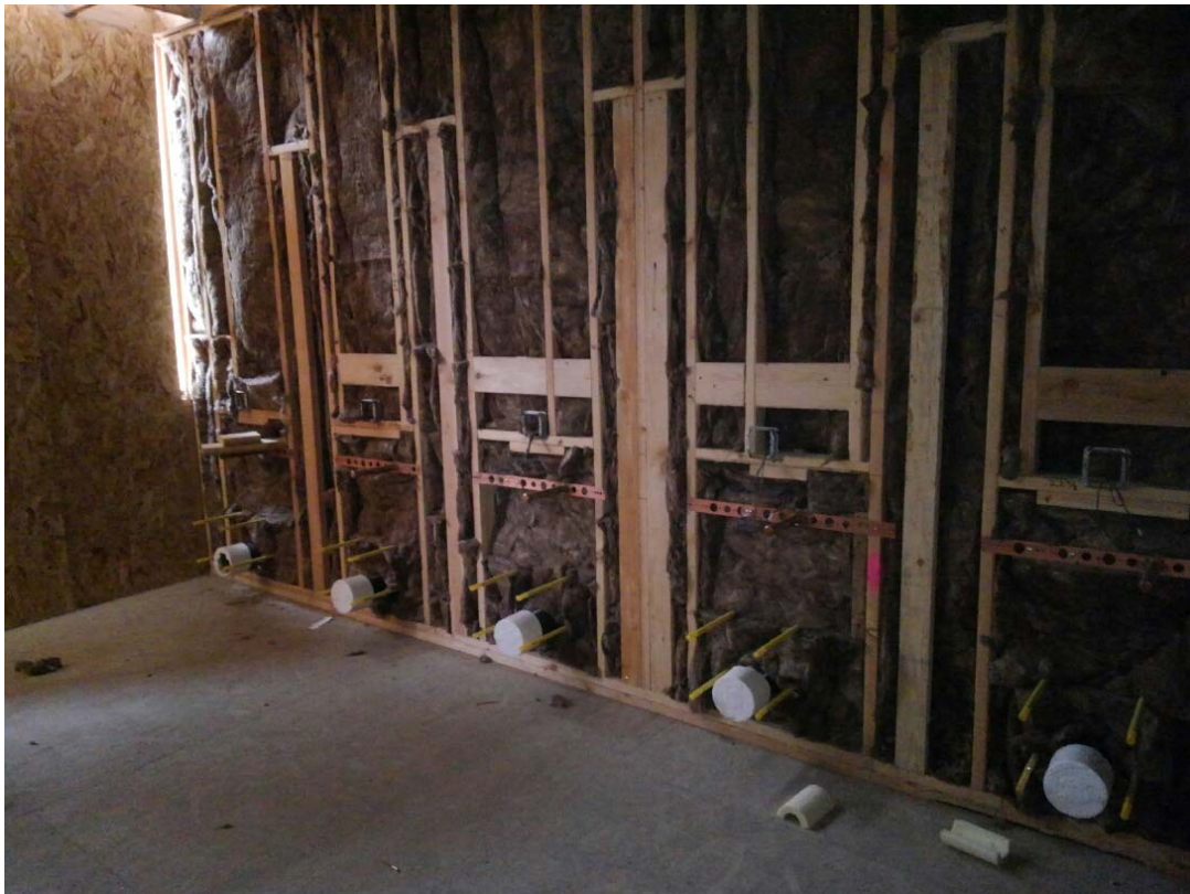
Bathroom plumbing is stubbed in for the second and third floor bathrooms.