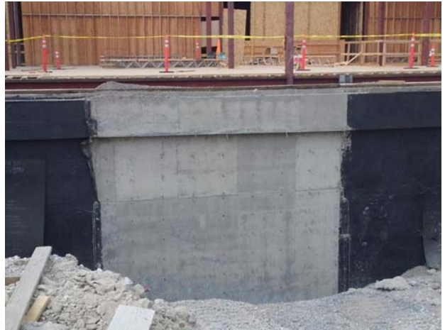
North Wing wall progress: Nearly buttoned up!! ...and the Monclaire Street foundation wall is complete.