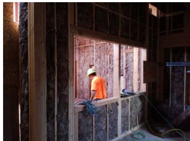
The Main floor hallway is being modified into storage spaces...and Student Study Areas