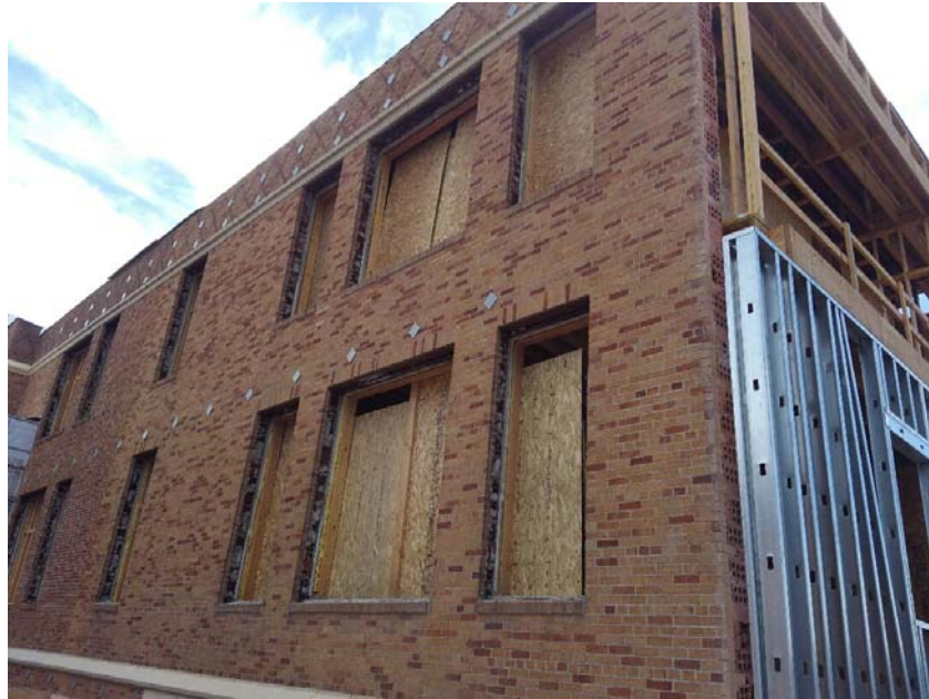
The old windows are being removed and crews are preparing to install the new windows.