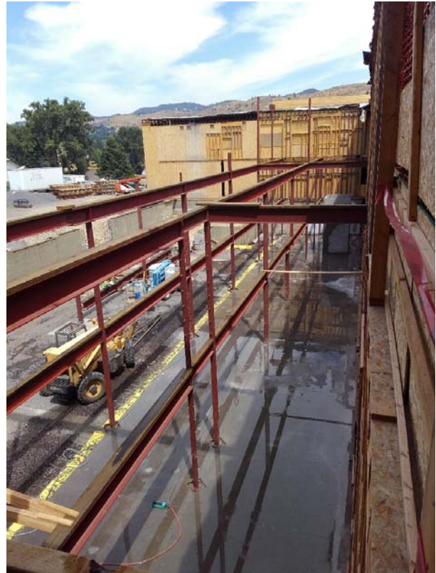
Steel Beam construction continues to expand, filling up the center of the new Academics building.