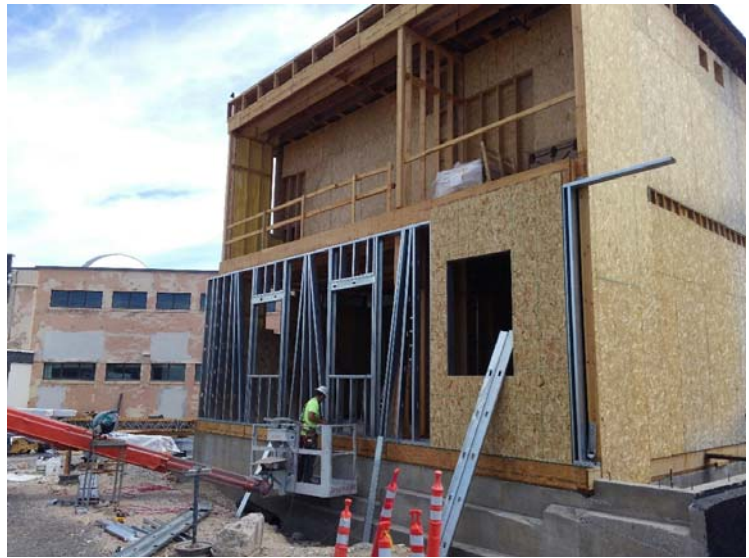
North wing walls are being framed in, with the wing closest to Pel Court slightly ahead in the process.