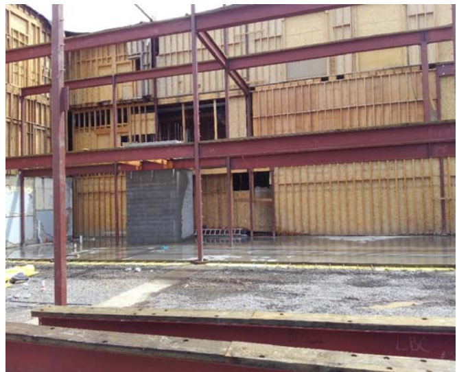
The first half of the basement floor slab has been poured.