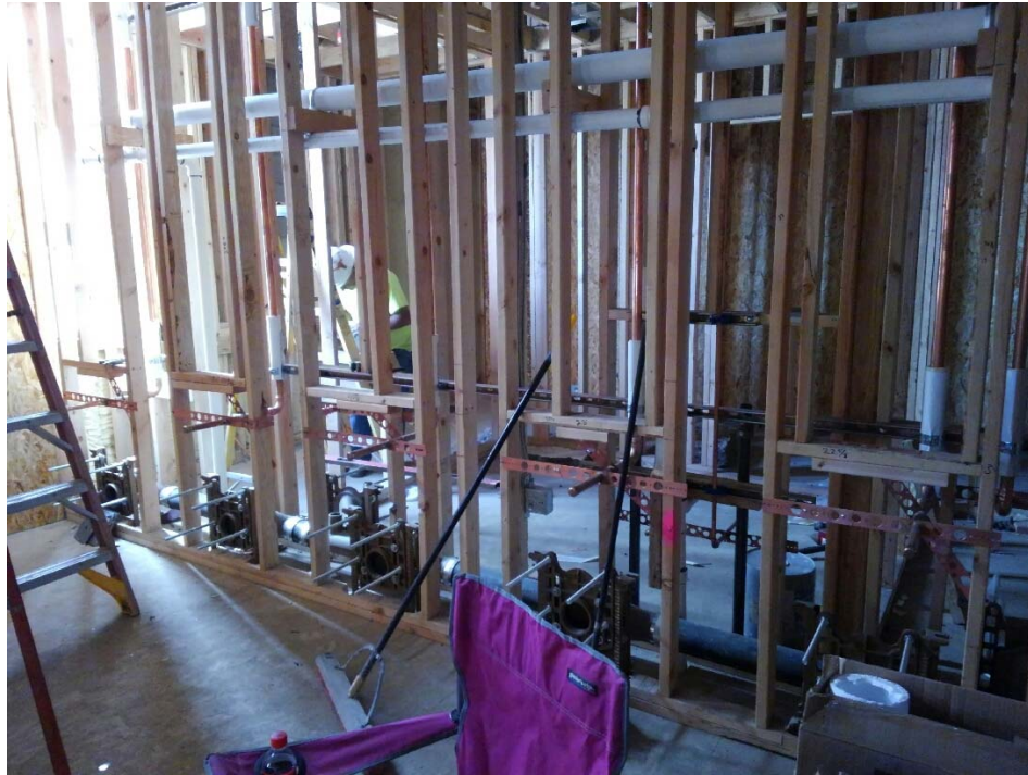
The Second (Main) and Third floors are getting bathrooms plumbed...